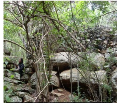
British Gun Escarpments

British Gun Escarpments can still be seen on the Kasighau hill. This was a very strategic point for the British army during the war. One can also interact with the culture, enjoy a local meal and also be able to see the women basket weaver's products.